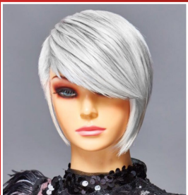
Individual Ladies Salon Cut MH

ENTER AND WIN OMC MASTER STYLIST AWARD 50 YEARS & OVER